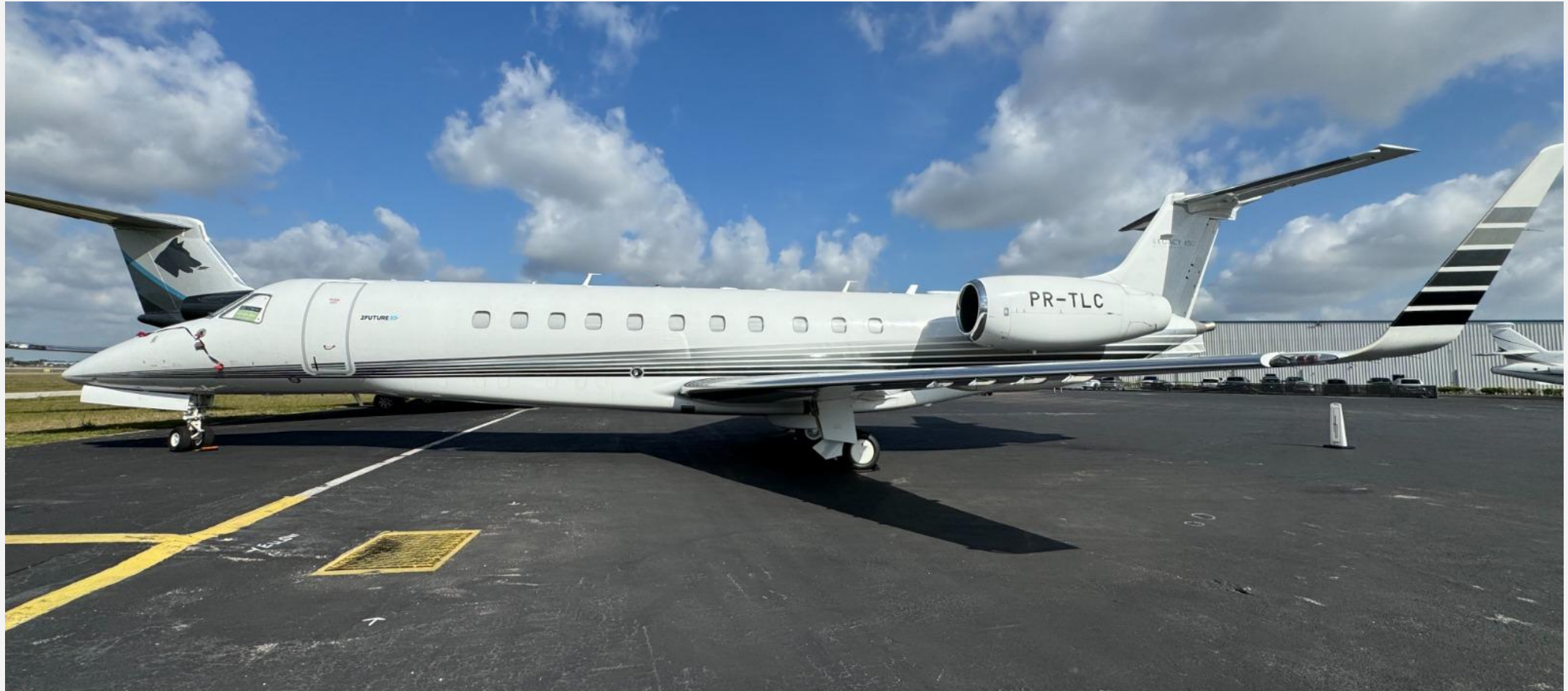
2012 Embraer Legacy 650