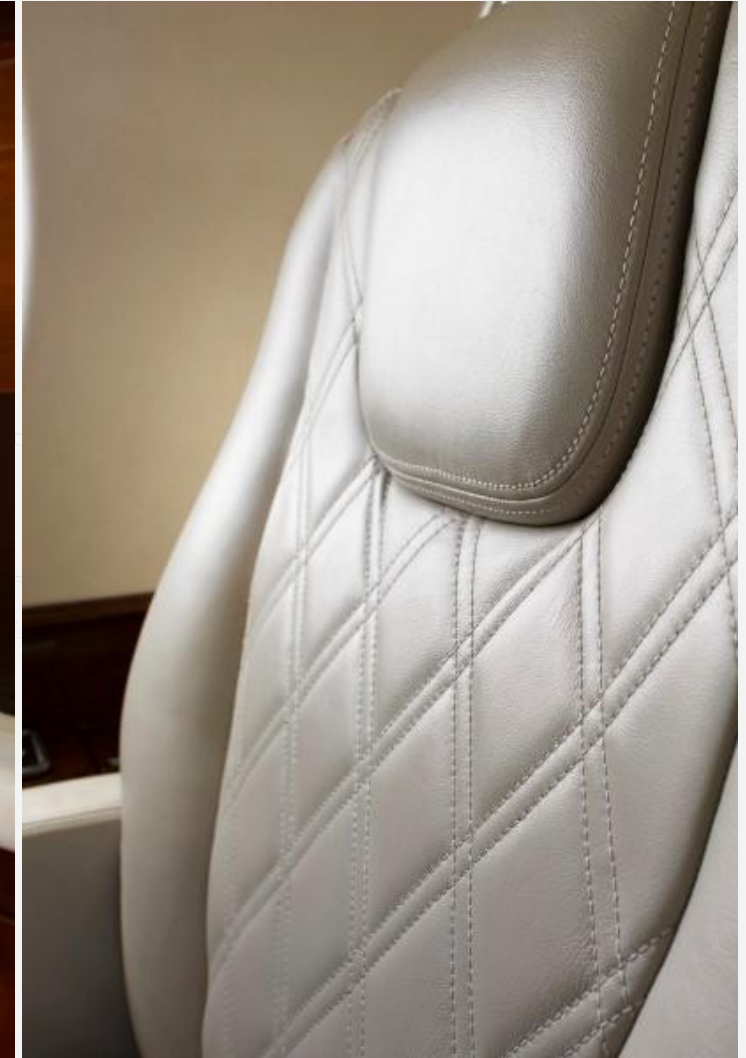
2012 Embraer Legacy 650