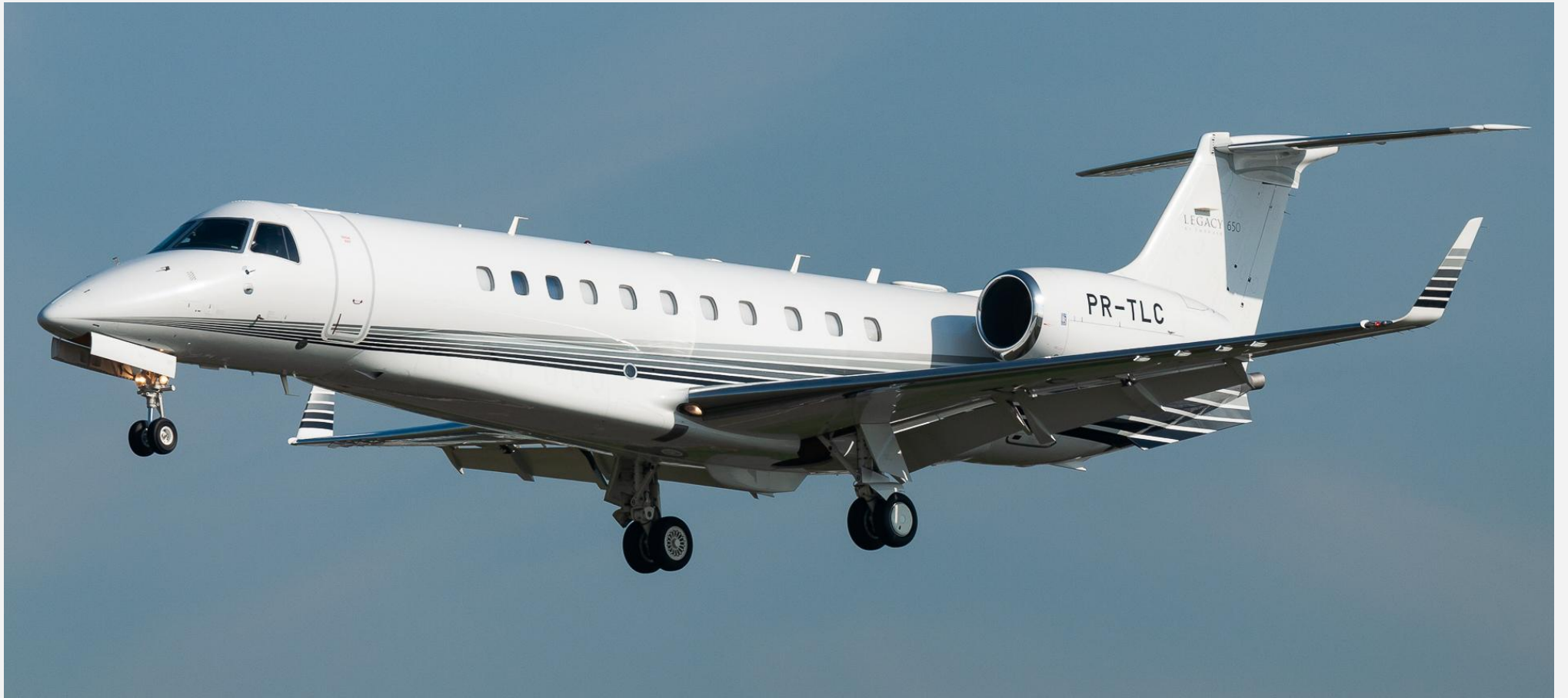
2012 Embraer Legacy 650