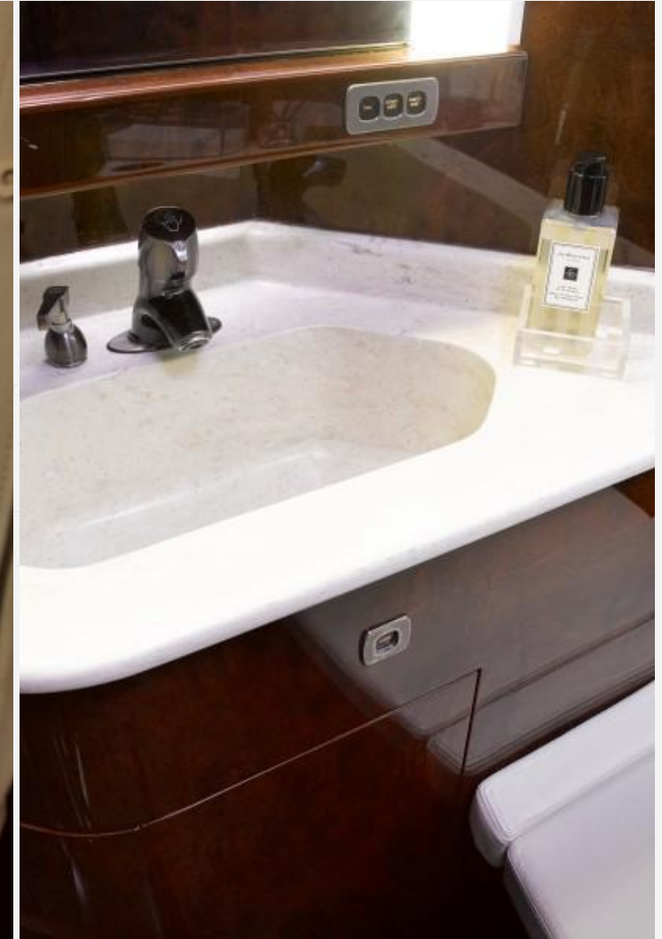
2012 Embraer Legacy 650