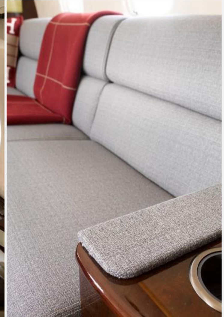
2012 Embraer Legacy 650