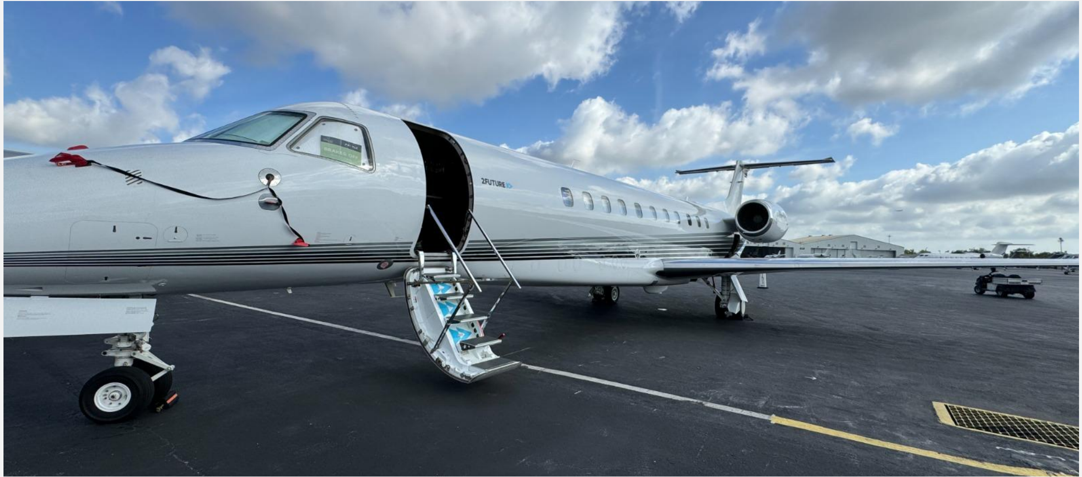
2012 Embraer Legacy 650