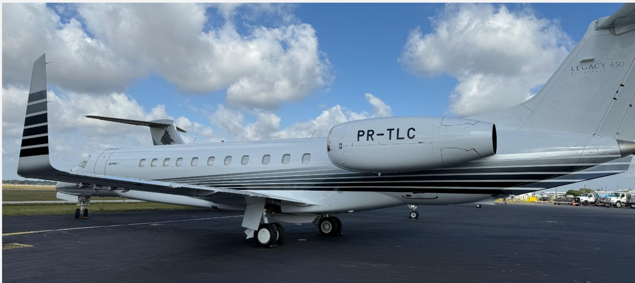
2012 Embraer Legacy 650