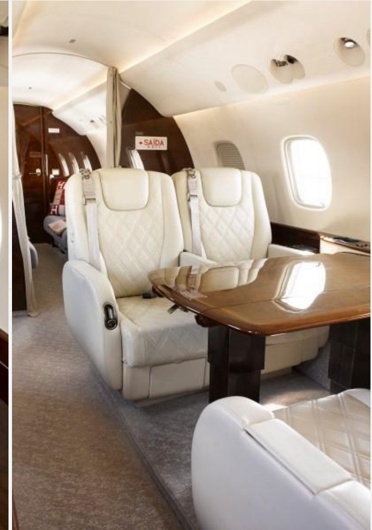
2012 Embraer Legacy 650